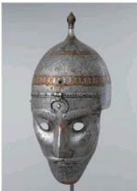
Helmet with Mask, Iran, 16th century

Wouldn't it be great to learn more about the time of the Tzars in Russia? What a period of great power, trouble, aristocracy, and opulence that was. Recently, there has been much written about heads of state traveling and providing their counterparts and/or royalty with gifts, as when the Obamas visited with the British royal family and exchanged gifts.